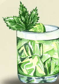
Cucumber Mint Lime Spritz