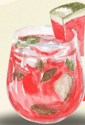
Strawberry Melon Breeze